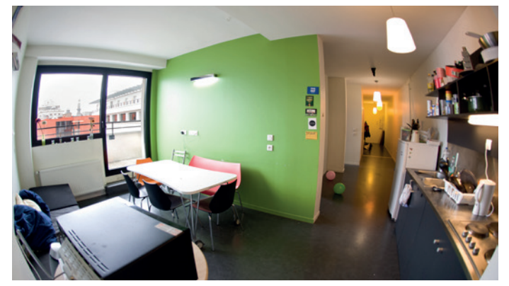
Shared apartment at the Maison-des-Etudiants (CROUS)